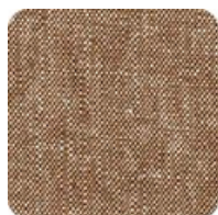
Essex Yarn-Dyed Nutmeg E064-1255